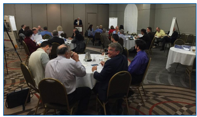
Welcoming participants to the Board retreat

The Board came to a consensus on seven (7) strategic directions that would serve as the purpose for this Plan: