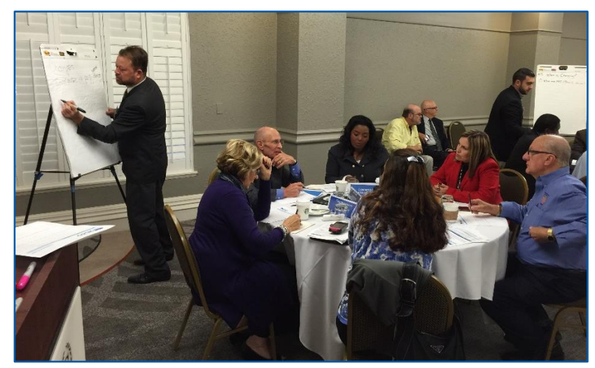
Documenting ideas at the Board retreat