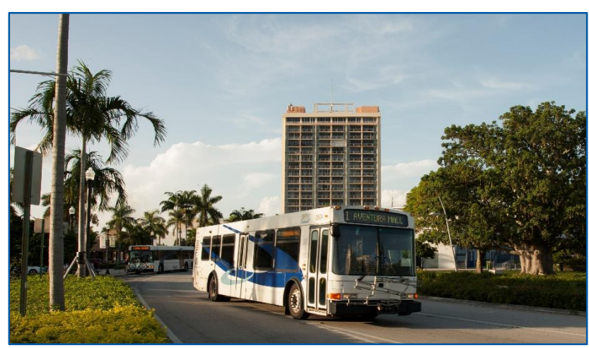
Broward County Transit bus service at Young Circle