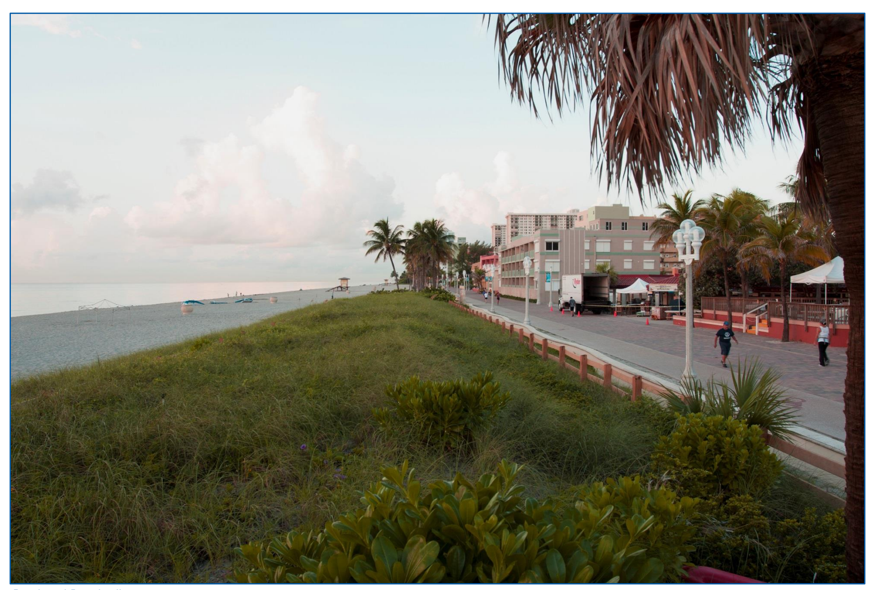
Beach and Boardwalk