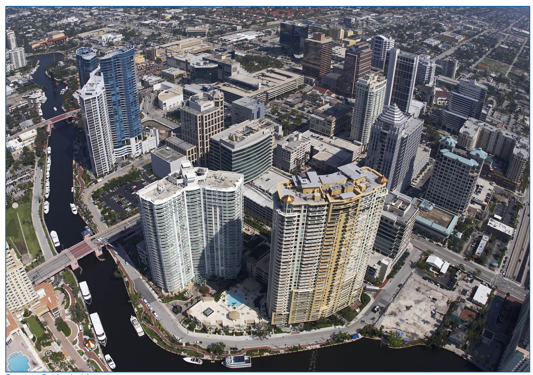
Downtown Fort Lauderdale