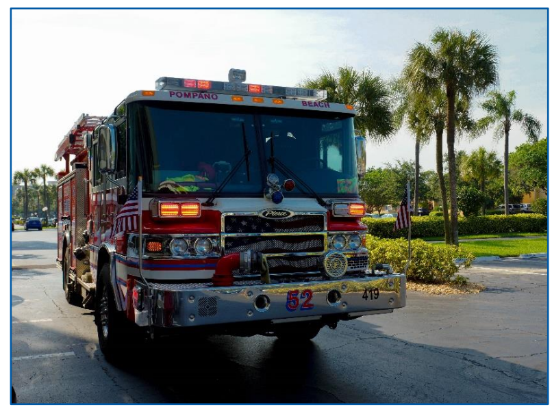
Fire engine within a local community