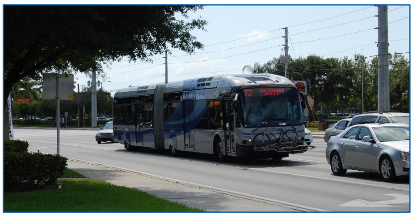
Broward County Transit bus service along Oakland Boulevard

The seven (7) strategic directions relate directly to Commitment 2040 and have been grouped based on their ability to achieve its core goals: move people, create jobs, and strengthen communities.