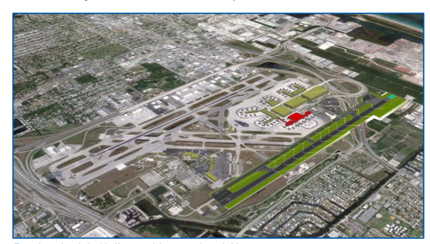
Fort Lauderdale Hollywood International Airport