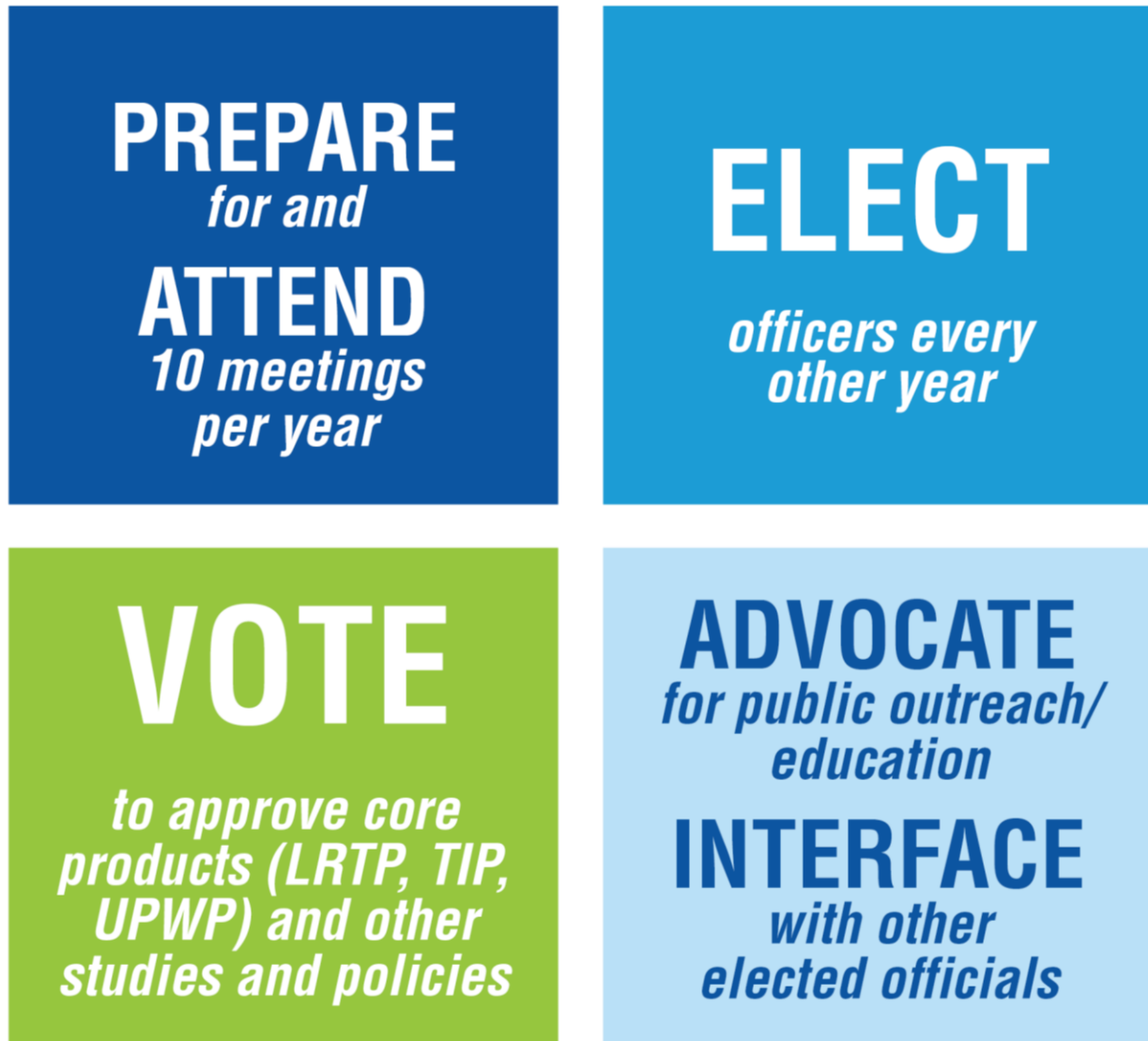
Figure 3. Board Responsibilities