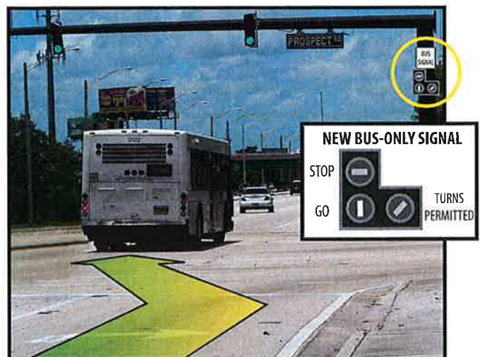
Illustration of new bus-only signal.