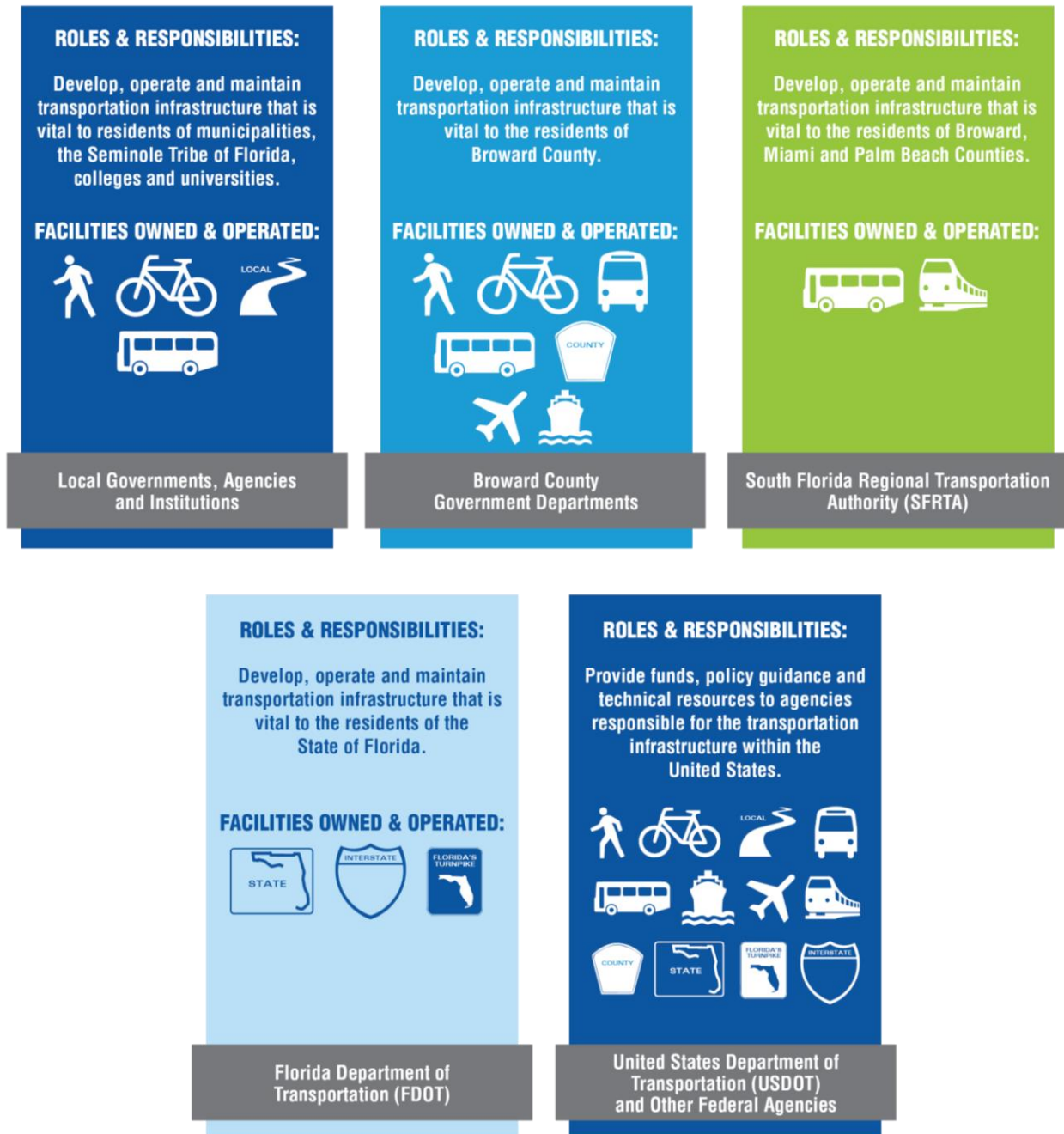
Figure 4. Planning Partners