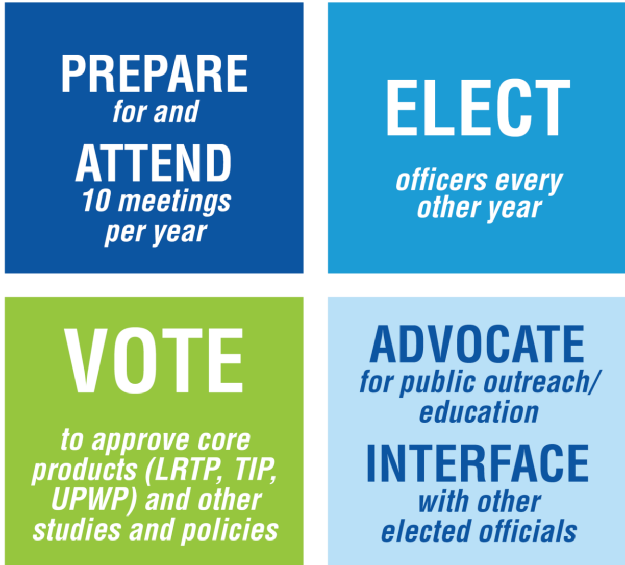
Figure 3. Board Responsibilities