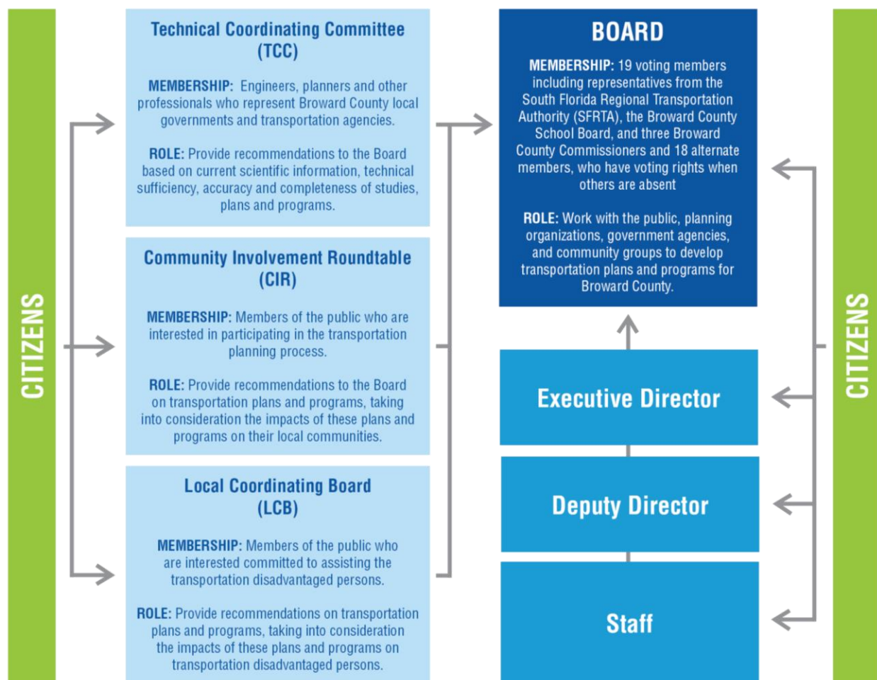
Figure 5. Organizational Chart