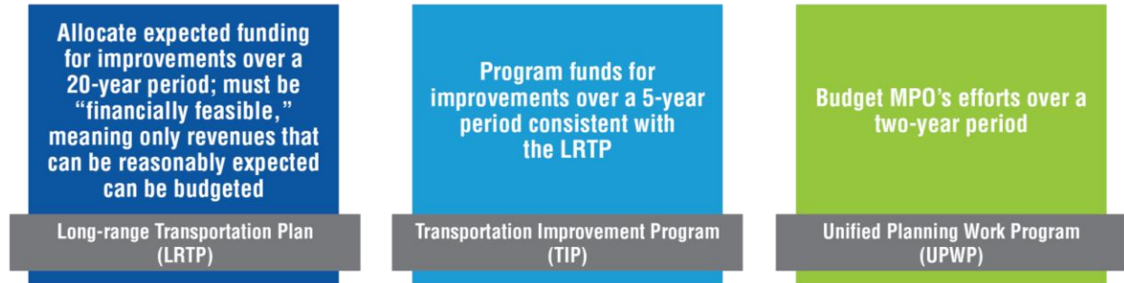
Figure 2. Products and Services