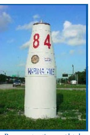
Buoy construction completed September 2005.

tinues west to Port Blvd/ SW 30 Avenue. The transportation enhancements include two unique, three dimensional buoy signs, the relocation of 39 sabal palm trees and 112 new sabal palms within the median. This project is a collaborative effort that will safely beautify the area and provide a sense of place for this highly traveled corridor. The project is scheduled for completion by the