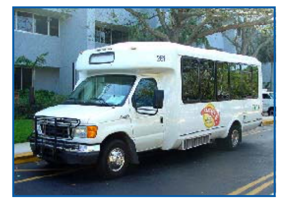
BEWE Shuttle at One University Drive in Plantation.

future, while improving our economic and