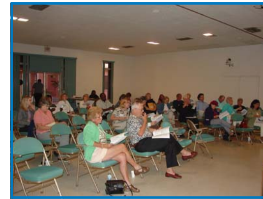
Attendance at the Scenic Highway A1A Workshop included audience members from more than 15 municipalities within Broward County.