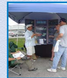
Members of the public took time during Garden Fest 2008 to speak with Broward MPO staff about transportation issues that were important to them.