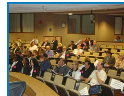
Many transportation agencies, as well as members from the public, attended the 2008 SEFTC Regional Transit Funding Summit.

The SEFTC was created to serve as a formal forum for policy coordination and communication to carry out regional initiatives agreed upon by the MPOs from Broward, Miami-Dade, and Palm Beach Counties. For more information on the SEFTC, please visit http://www.miamidade.gov/mpo/seftc/home.htm .